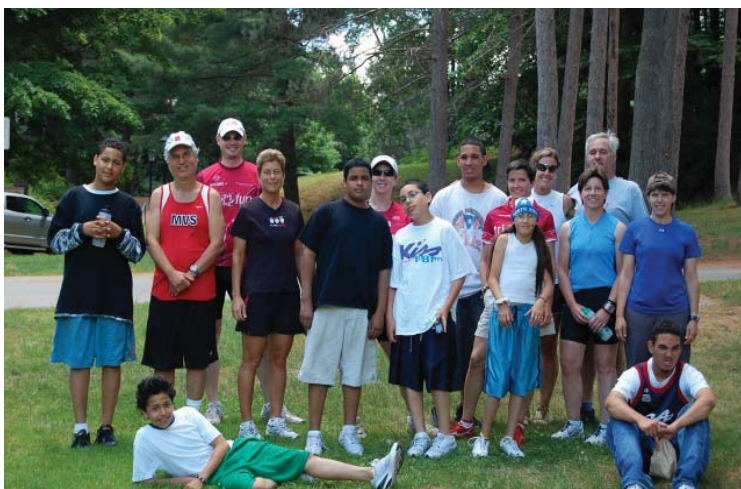
Project Venture participants relax with TriFury and M.V.S. volunteers after a training session at Phillips Academy in Andover

And congratulations to all the participants of the duathlon. Your hard work certainly is to be admired!